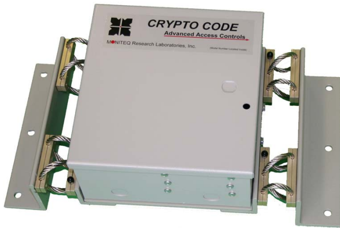
Figure 1, CC-8521AN Crypto-Lock

The Crypto-Lock Model CC-8521A is a versatile, easily installed and operated single door access control system. It provides reliable keypad access control using a single 3, 4 or 5-digit PIN code for all users.